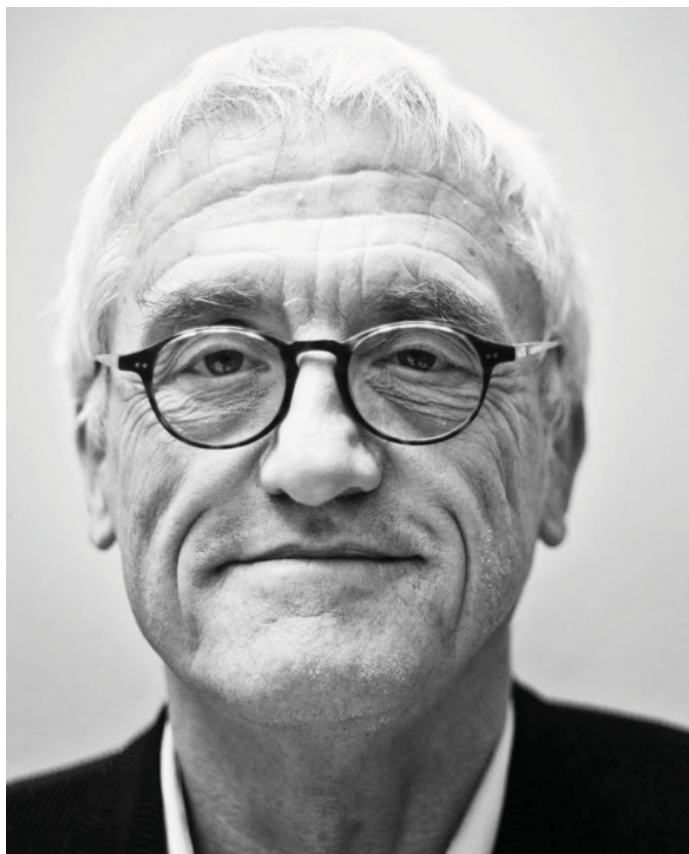
Professor Jan Tomasz Gross

On 21 June 2011, the AHRCentre co-hosted a seminar with the Network for the Interdisciplinary Studies of Law featuring Princeton scholar, Professor Jan Tomasz Gross. Professor Gross spoke about the research and findings contained in his book Neighbours , which has been the subject of extensive controversy in Poland and beyond. Professor Gross is the Professor of War and Society, and Professor of History at Princeton University, and is the